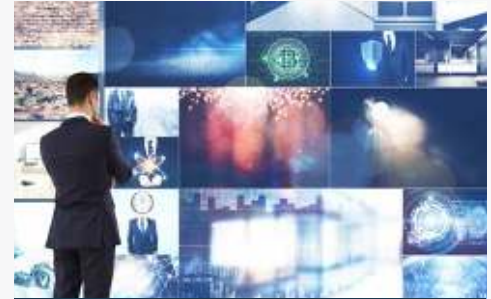
VERSATILE DISPLAY MANAGEMENT