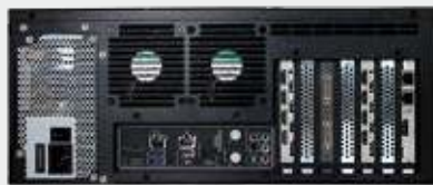
VuScape VS120-3 Rear