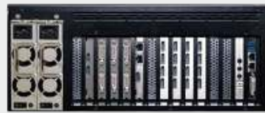
VuScape VS640-3 Rear