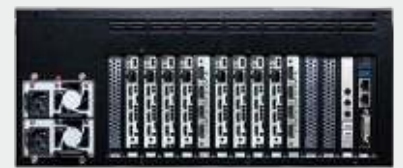
VuScape VS400-2 Rear