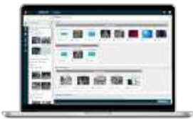
TRx Centralized Management