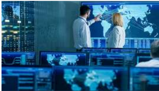
VIDEO WALL CONTROL AND KVM