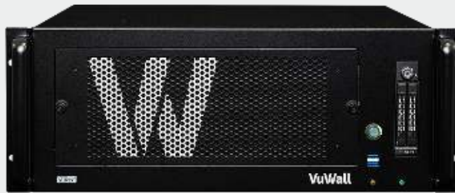
VuScape VS120, VS280, VS400, VS640