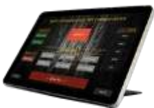
ControVu Touch Panel