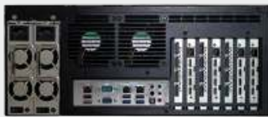
VuScape VS280-2 Rear