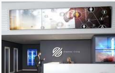
CONTENT MANAGEMENT AND DISTRIBUTION