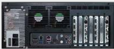
VuScape VS120-2 Rear