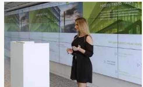
PRESENTATION AND COLLABORATION