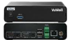
VuStream Encoders & Decoders