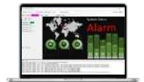
Enhancements More Interoperable Products

VuWall Technology Inc. 181 Hymus Blvd., Suite 301 Montreal, Quebec H9R 5P4, Canada Tel. +1 514 505 4436