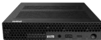
VuScape VS10-1 & VS10-4